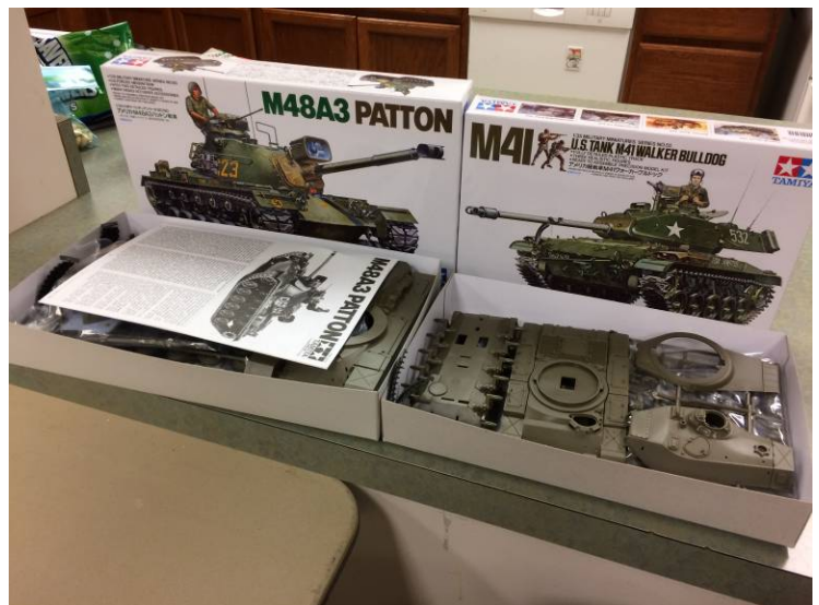
Paul Hayward brought in some goodies recently purchased for future shows.